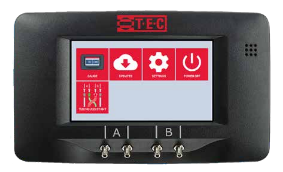
DG-1000 Pressure and Flow Gauge

The Minneapolis Duct Blaster System comes with a DG-1000 Pressure and Flow Gauge. This high accuracy differential pressure gauge measures the pressure difference between either of the input pressure taps and the corresponding reference pressure tap. Two separate measurement channels allow you to monitor the duct pressure and fan flow simultaneously during a test. The DG-1000 is packed with features to help you set up the gauge to perform a variety of tests related to duct testing and air handler measurements. In addition you are able to show leakage and flow values in a number of metrics.